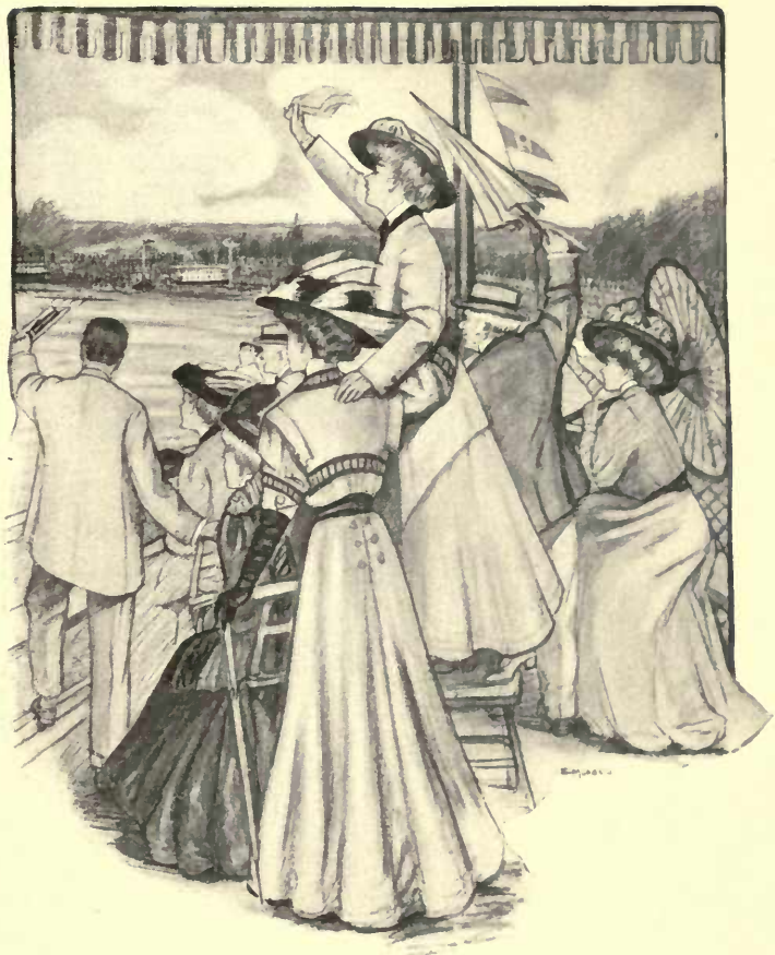
SOMETHING HAD HAPPENED IN THE SECOND BOAT