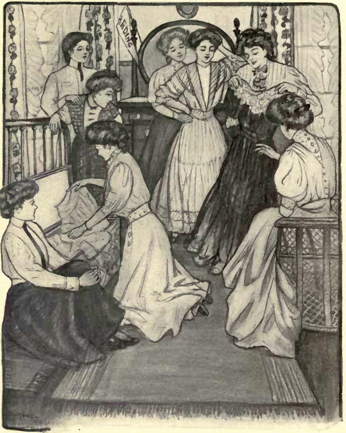
"NOW COME AND LABEL HER DRESSES"