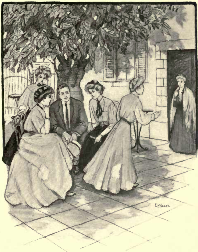
THE GIRLS POUNCED UPON HER